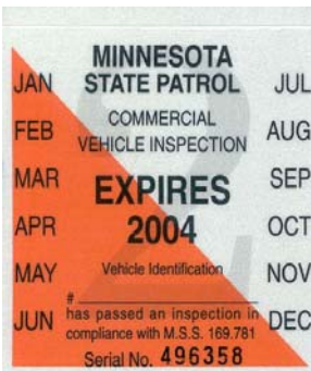
Figure 1—Decal noting that the vehicle was inspected according to the annual inspection requirements.